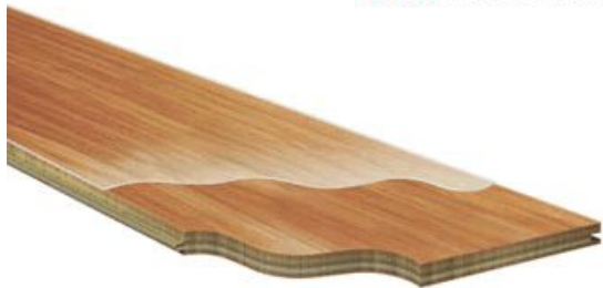
ENGINEERED WOOD FLOOR