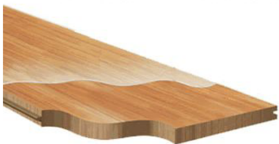
SOLID WOOD FLOOR